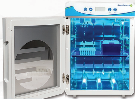
6-bulb design with UV-C transparent shelf for 360° exposure